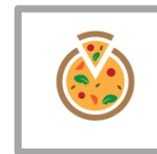
Grain and M/MA