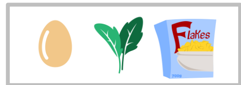
Meat/Meat Alternate or Vegetable/Fruit or Grain