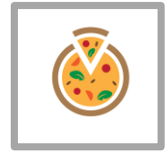
Grain and M/MA