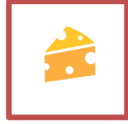
Meat/Meat Alternate (M/MA)