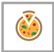
Grain and M/MA